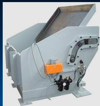
Controlled curve release trough for ThyssenKrupp Danville, USA