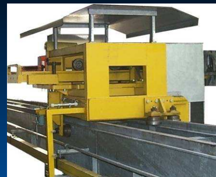
Wagon movement for even filling of bulk goods